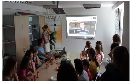
Primary school visits, Slovenia ( June, 2019 )

For further information, visit our NEWS section.