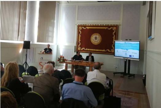
RETI Symposium , Las Palmas de Gran Canaria ( May, 2019 )