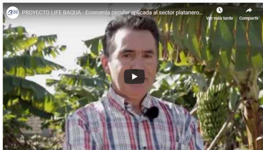
New video of LIFE BAQUA Project ( May, 2019 )