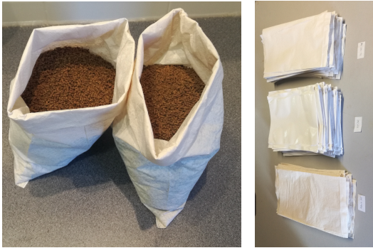
3 rd Generation of fish feed bags, Canary Islands ( March, 2019 )