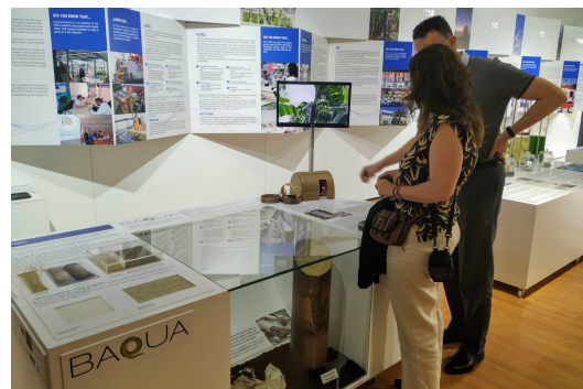
Stand of LIFE BAQUA in Elder Museum, Las Palmas de Gran Canaria ( May, 2019 )